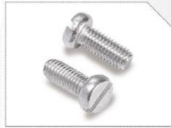
Pan Head Machine Screw