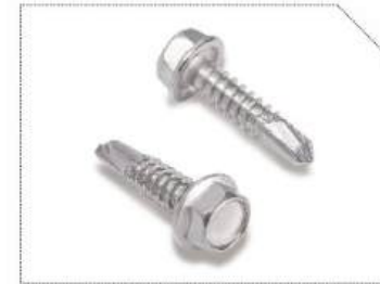
Hex Washer Head Self Drilling