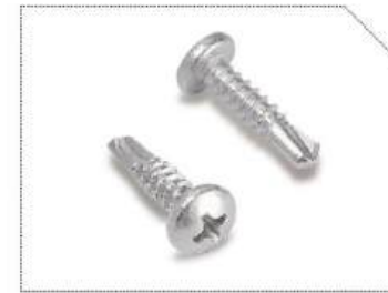
Pan Head Self Drilling Screw