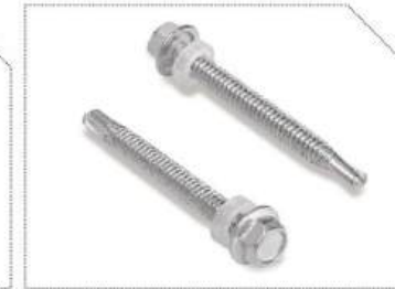
Hex Washer Head Self Drilling