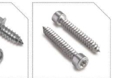
Hex washer Head Self Tapping Screw