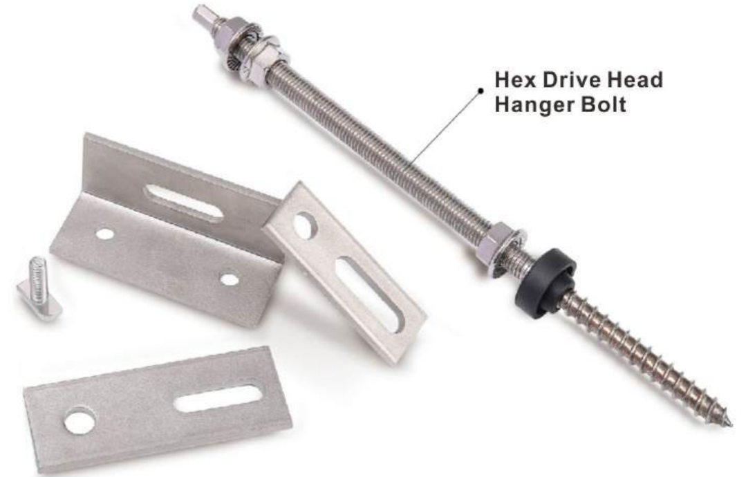
Hex Drive Head Hanger Bolt

We can provide professional and comprehensive one-stop mounting solutions for photovoltaic systems. Our products include rooftop photovoltaic mounting systems, ground photovoltaic support systems, photovoltaic support accessories, etc.