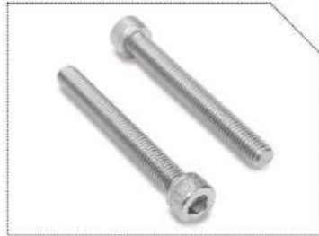
Hex Socket Head Bolt