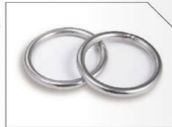
Welded Round Ring