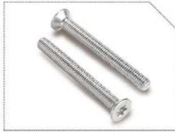
Flat Head Machine Screw