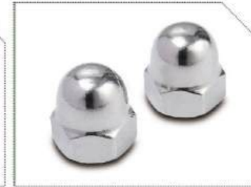
Hex Cap Dome Nuts