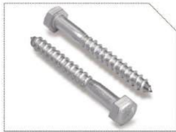
Hex Wood Screw