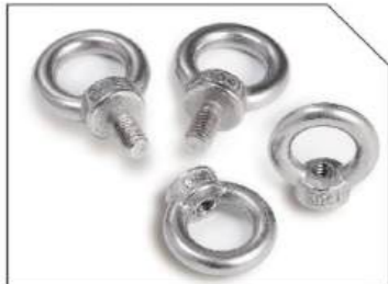
Ring Bolt & Ring Nut