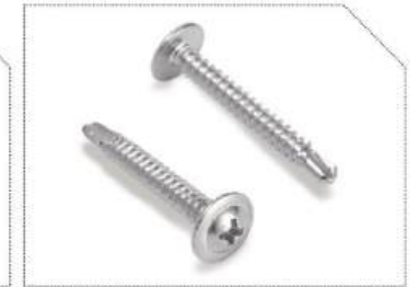
Modified Truss Head Drilling Screw