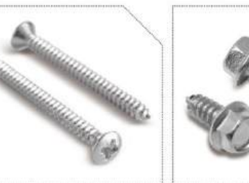
Raised flat Head Self Tapping Screw