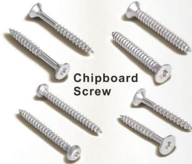
Countersunk Head Chipboard Screw