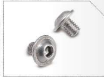
Hex Socket Round Washer Head Bolt