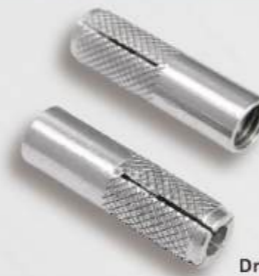
Drop in Anchor