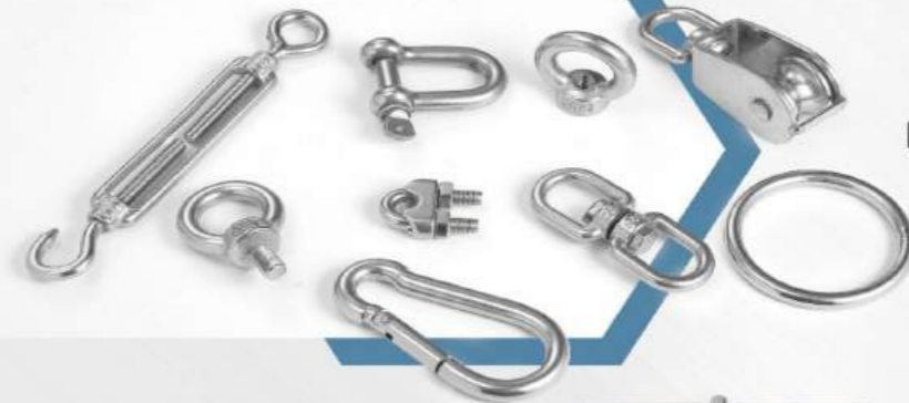
Rigging & Pins