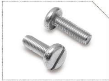
Pan Head Machine Screw