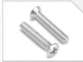
Raised Flat Head Machine Screw