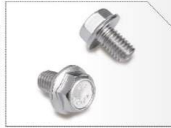
Hex Flange Head Bolt