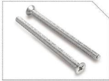
Flat Head Machine Screw