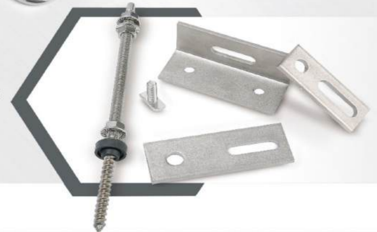
Solar Photovoltaic Bracket Fitting