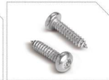
Pan Head Self Tapping Screw