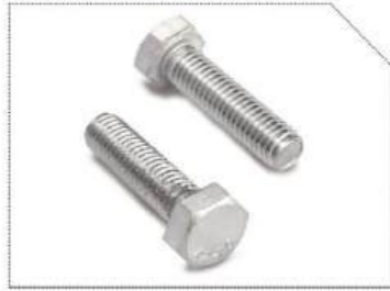
Hex Bolt Full Thread