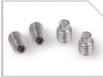
Hexagon Socket Set Screw