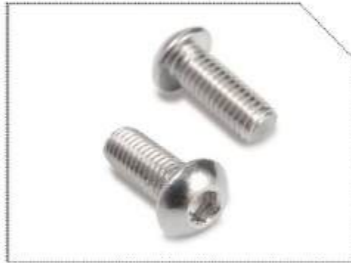
Hex Socket Round Head Bolt