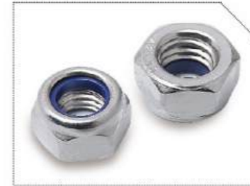
Nylon Insert Lock Nut