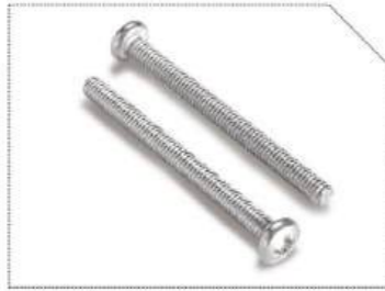
Pan Head Machine Screw