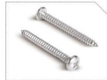
Pan Head Self Tapping Screw