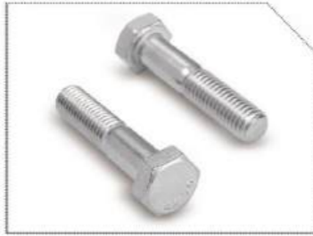
Hex Bolt Partial Thread