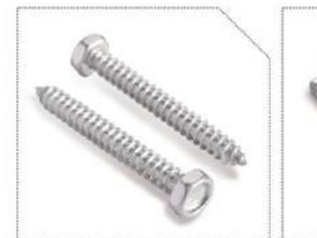
Hex Head Self Tapping Screw