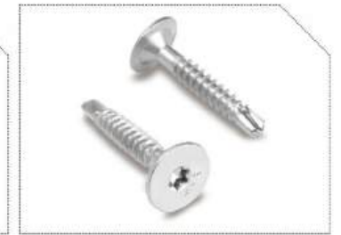
Flat Top Head Self Drilling Screw