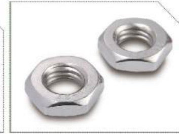
Hex Thin Nuts