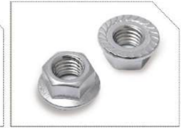
Hex Flange Nut