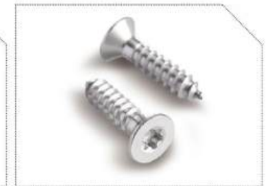
Flat Head Self Tapping Screw