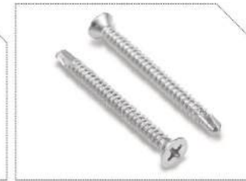
Flat Head Self Drilling Screw