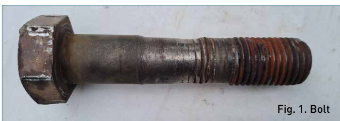
Fig. 1. Bolt

Apart from some people kicking it, nothing happened at all. No one stopped to wonder what the screw was doing there, how it got there, and why it came loose. Everyone was hurrying about their business. No one realized that a screw as such can also serve as a valuable study material.