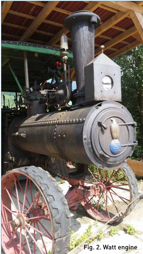
Fig. 2. Watt engine