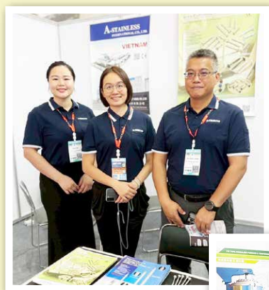
▲ A-Stainless International

The dates of the next edition of the show have yet to be announced. For the latest event information, stay tuned to Fastener World's official website at www.fastener-world.com .