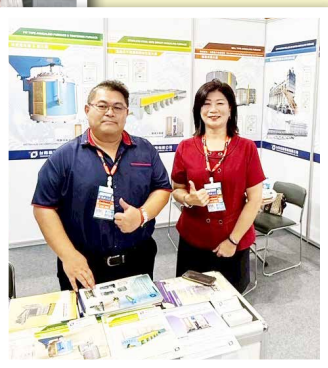
▲ Chin Chang Electrical