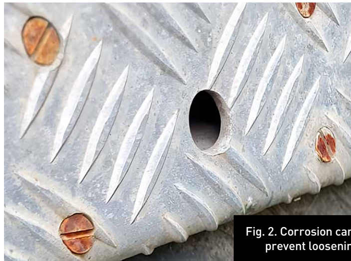
Fig. 2. Corrosion can also prevent loosening

same time very important. Another option is blasting using a suitable abrasive medium or a chemical method of removing corrosion.