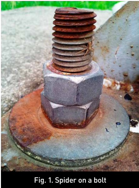
Fig. 1. Spider on a bolt

How to clean the surface of rusted bolts? For example, can a spider (Fig. 1) help with that?