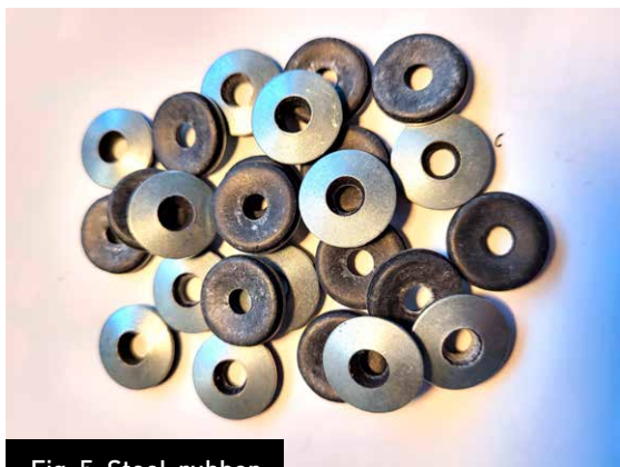
Fig. 5. Steel-rubber

It's simple, e.g. for the locking nuts in Fig. 6, in which the plastic retaining ring used is easily replaceable or replaced by an all-metal variant.