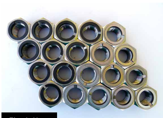
Fig. 6. Nuts

Of course, there are many other practical ideas, for example C-zero technology. This applies mainly to protective atmospheres for the heat treatment of screws and nuts. These atmospheres (hardening and cementation) contain high amounts of CO 2 and flow freely into the surrounding air. The solution options are quite real. It is primarily the replacement of carbon with nitrogen or other inert gases (Argon). After all, a provocative question still remains open. Is it technically possible to use the protective atmosphere twice? But this is no longer a problem for manufacturers of fasteners, but of furnace equipment such as SAFED, EBNER, AICHELIN, etc. The author is ready to establish contact with these and similar companies again.