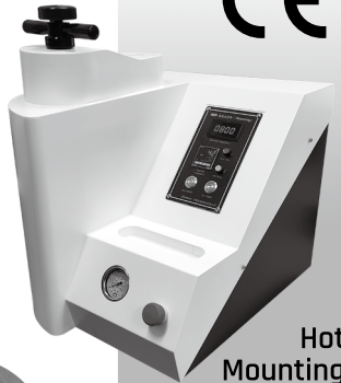
Hot Mounting Machine