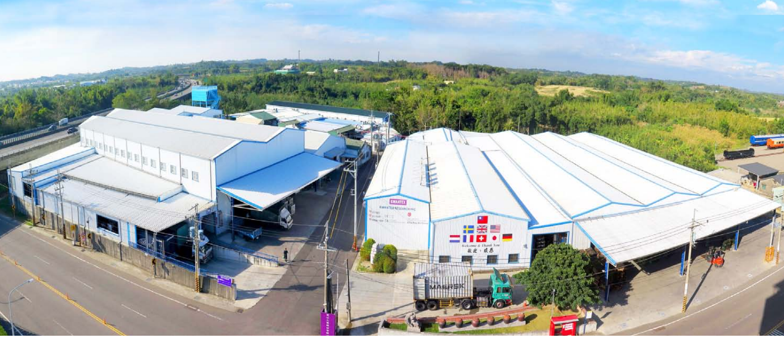
Comparison Between TTX® Bit and TX Bit: