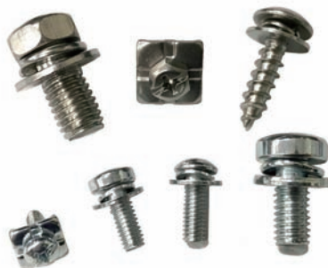
SEMS Screws M2.0~M10

Aby Screw is well-known for its quick delivery of samples and the ability to develop innovative products, both of which make it the best supporter to customers eager to seek for high efficiency and innovation on the fast-changing market. Always considering customers' profit priority, Aby Screw is able to manufacture a diverse range of complicate products in low volumes as per customer's request. Thus far, it has successfully manufactured for customers many customized products, such as special SEM washers (DIN6900 Z4-Z1), small PT threaded screws, and electronic screws. It offers a comprehensive range of various precision and SEM screws in stock.