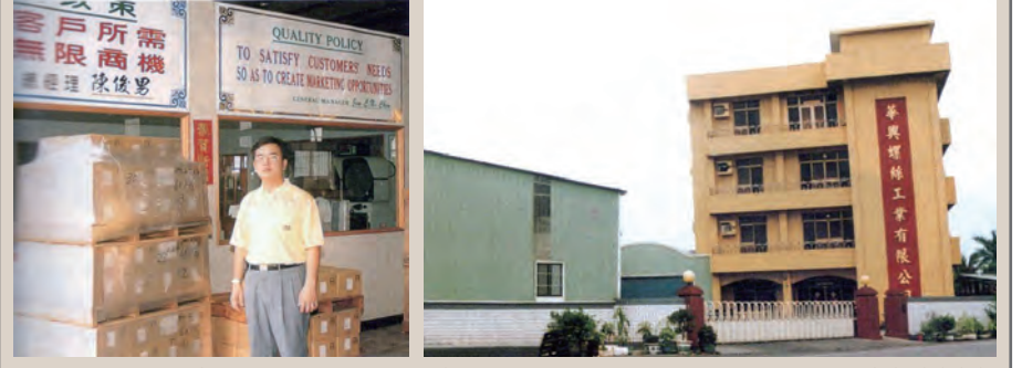
Hwa Hsing Screw Industry Co., Ltd. was Accredited to ISO 9002