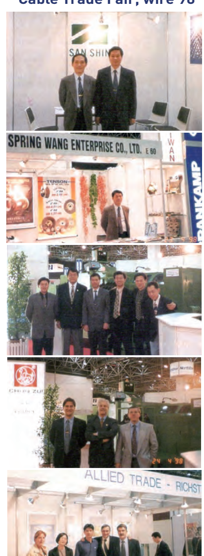
7th International Wire and Cable Trade Fair, wire 98