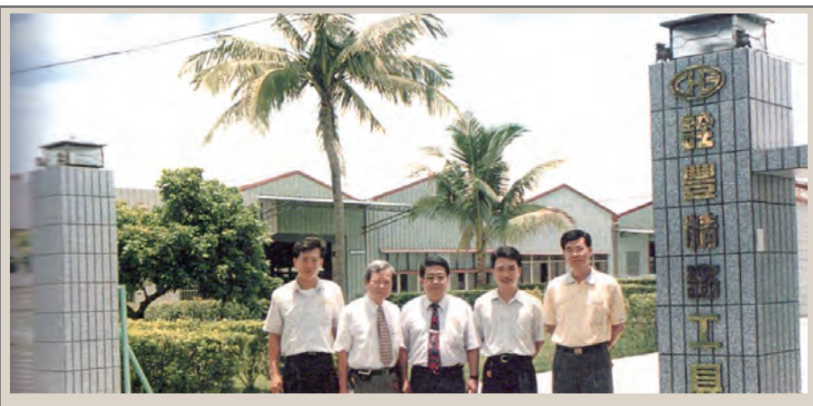
Chuan Hong Precision Tool Co., Ltd. Received ISO 9002 Certificate