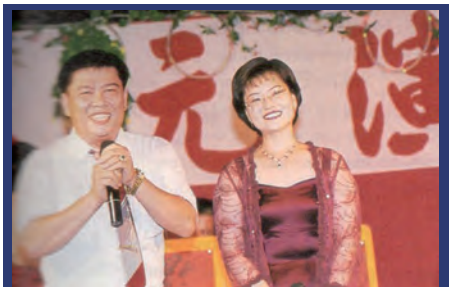
Shuenn Chang Fa Enterprise's 15th Anniversary and Completion of its Second Plant

The 7th International Wire and Cable Trade Fair, wire 98, was the world's then-largest wire and cable machinery show, gathering 37,275 visitors from 103 countries, along with 1,045 exhibitors from 45 countries. The main feature of the show was that over half of the exhibitors were from outside Germany. Although the financial crisis resulted in decreased number of visitors from Southeast Asian countries, numerous European visitors still participated.