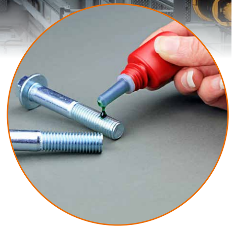
Fig. 2. Thread locking chemical

The electronic torque wrench also measures rotation angle. Parameters were set for the amount of torque required to achieve a certain preload with respect to the viscosity of the thread locking material on the threads of the screw and with the amount of torque angle that should be achieved.