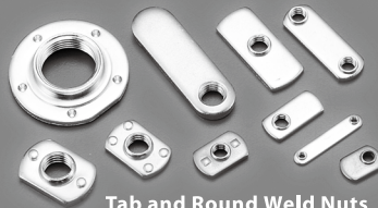
Tab and Round Weld Nuts