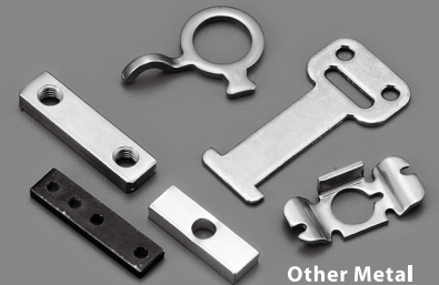
Other Metal Stampings