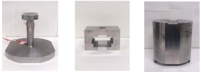
Figure 2 (b)

a test equipment which can measure the two coefficients of friction separately. The fastening torque applied to the nut is measured by a torque wrench. Using strain gages and crossed gages installed on the test equipment, axial bolt force and the torque exerted on the threaded portion are measured, from which the coefficients of friction can be calculated. Assuming that the two coefficients of friction are the same value, we can obtain the coefficient of friction just by measuring the fastening torque and axial bolt force. Please refer to author's book, "Threaded Fasteners for Engineers and Design – Solid Mechanics and Numerical Analysis –", for more details.