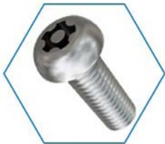
5 Lobe Pin

A new range of security fasteners has been launched to help businesses to cut the cost of being a victim of crime from their overheads. The innovative 5-Lobe pin from TR Fastenings is the first complete range of security fasteners made from corrosion-resistant A4-70 stainless steel - the perfect product for outdoor use, in particular in marine, health and medical sectors because of its non-reactive qualities. The fastener's five-sectioned screw head means that it can only be undone by someone with specialist tools, preventing its removal by an opportunist criminal. Fastenings made with corrosion-resistant A4-70 stainless steel do not degrade if they come into contact with salt water and other chemicals that have an impact on other forms of steel. The durability of the high grade material means that components need to be replaced less often.