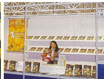
At-Home Enterprise Co., Ltd.

During the year of 2000, many Taiwanese fastener companies were also certified by ISO-9002 and these companies were: