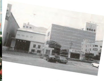
Special Rivets Corp.

established in 1981 gave its new factory inauguration on Nov 19, 1995 and gave a ribbon-cutting ceremony at Taichung Industrial Park on Dec. 05. The new factory and office building span the area of 2,463 m<sup>2</sup> (2,050 m<sup>2</sup> for the factory and 926 m<sup>2</sup> for the office building), which offer clean and bright workplace to employees in order to give them good work emotion and increase their work efficiency.