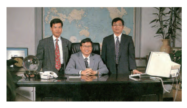
Other companies certified to ISO 9002 in 1995 also included Fang Sheng, Ofco, Channg Chin, Chu Hua, Jinn Her, etc.

Chun Zu Machinery won two honors in 1995 twenty years after its establishment. Chun Zu was the first Taiwanese fastener company to be certified to ISO 9001 by Taiwan BSMI and achieve the machine sales record of over 6,000 sets. Chun Zu was very thankful for the support from its global customers who had made it able to demonstrate solid growth and continuous progress.