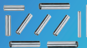
销钉 Dowel Pins