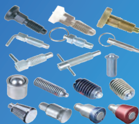
弹簧柱塞 Spring Plungers

Contact/联系人: Bruce Cao/操少林 TEL/电话: 86-510-68791198 Mobile/手机: 86-18855302510 FAX/传真: 86-510-85730629 E-mail/邮箱: purchase3@amda.cn Website/网站: www.amdausa.com Address/地址: 5F, Building A, No. 6, Xikun Road, New District, Wuxi, Jiangsu, P. R. China 中国江苏省无锡新区 锡坤路6号A栋5楼 ZIP/邮编: 214028