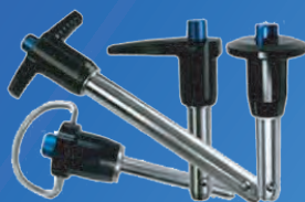
快拔销 Quick Release Pins