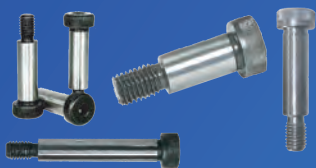
塞打螺丝 Shoulder Screws