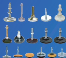
地脚 Leveling Mounts